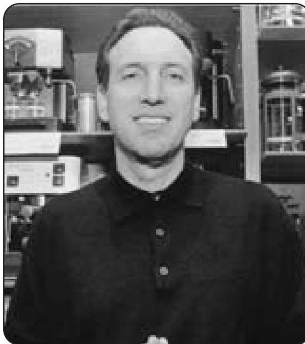
Howard Schultz is chairman and chief executive officer of Starbucks Corporation, the most successful retail chain selling specialty coffees and teas in North America.

Howard Schultz is chairman and chief executive officer of Starbucks Corporation, the most successful retail chain selling specialty coffees and teas in North America. When he traveled to Milan, Italy, in 1983, he was director of retail operations and marketing for Starbucks Coffee, Tea, and Spices—a 12-year-old, Seattle-based firm specializing in selling freshly roasted coffee beans, teas, and spices in bulk. Sitting in one of Milan’s many hundreds of espresso bars, Schultz saw coffee drinking in an intriguing new light. For the Italians sitting around him chatting and laughing with friends, this pastime was a key part of their social life and included not only good coffee, but also an inviting place in which to sit and drink it.